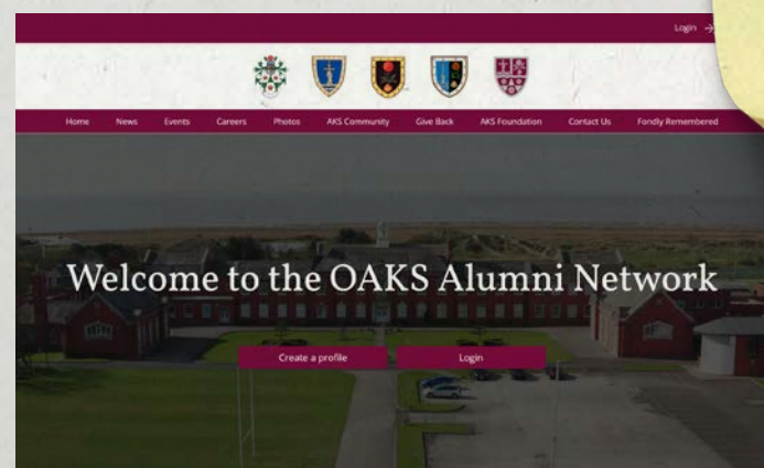
Right: Our new website, oaksconnect.com is now live!

I am hoping to bring you some exciting developments in 2023 from the new Development Office at AKS.